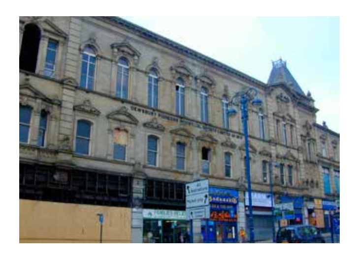
Case study 8: Dewsbury Pioneers Industrial Society

Some of these works were carried out, but those to the clock tower were not. The local authority then attempted to erect the scaffolding itself but was physically prevented from doing so by the owner's employees. As a result, a Repairs Notice was served as a prerequisite to a Compulsory Purchase Order.